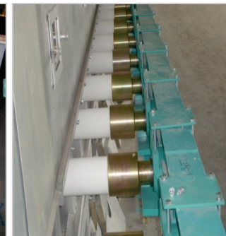
6" diameter ZYAROCK® lehr rollers in use for manufacturing of architectural float glass